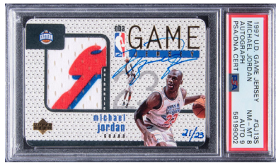
Michael Jordan autographed NBA All-Star Game Used Patch card