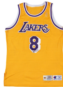
Kobe Bryant Earliest Known Photo-Matched Rookie Jersey

Goldin Auctions has built a reputation as the trusted leader in trading cards, memorabilia and collectibles. The company has consistently broken auction records this year and the company has already done over $200 million in sales in 2021.