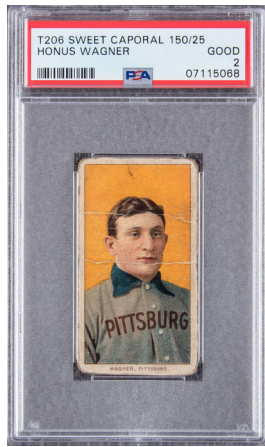
T206 Honus Wagner card