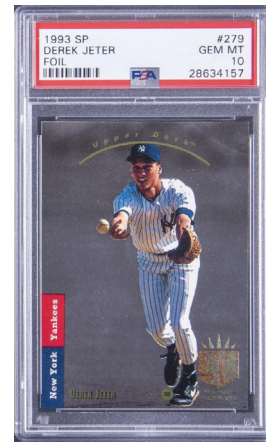
1993 Upper Deck SP Foil Derek Jeter Rookie card